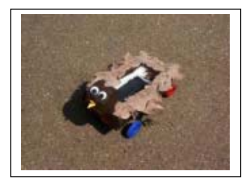
'Robin' by Colliers Green CEP School

WINNER – 'Robin' by Colliers Green CEP School