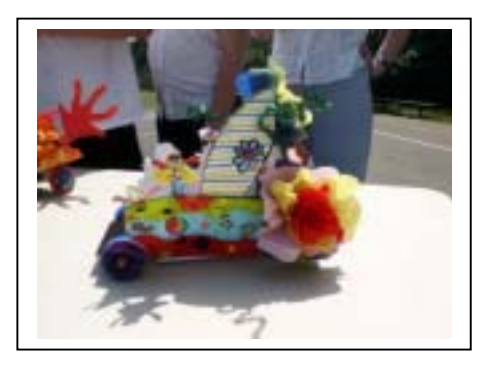
'Du Hippy Van' – Wingham Primary