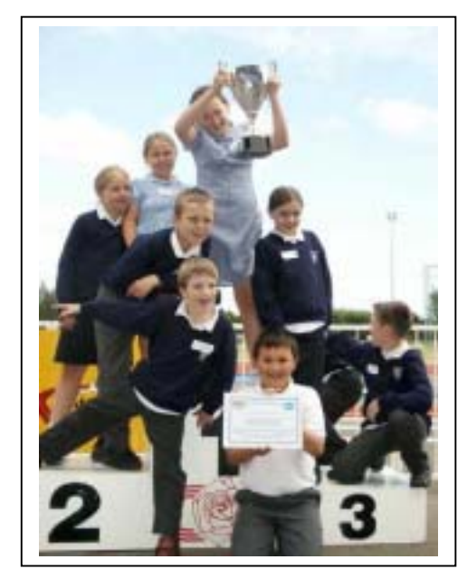
The proud champions jump onto the podium!