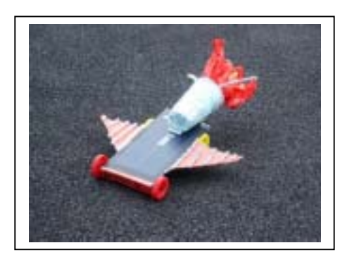
'Rock' – West Malling Primary