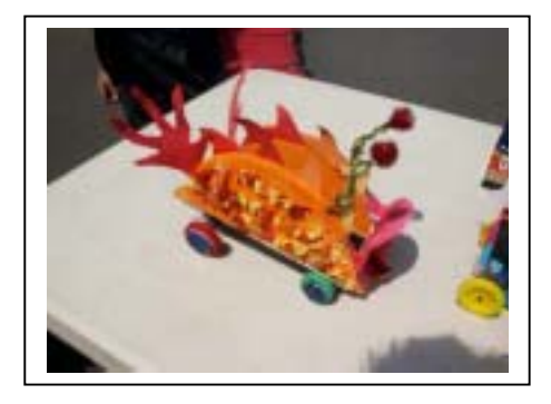
'Too fast too furious – St Richard's Primary