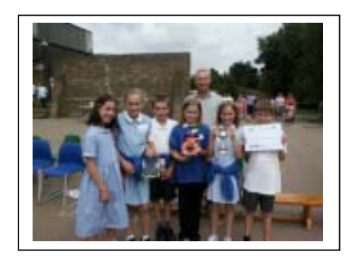
The winning team from Otford