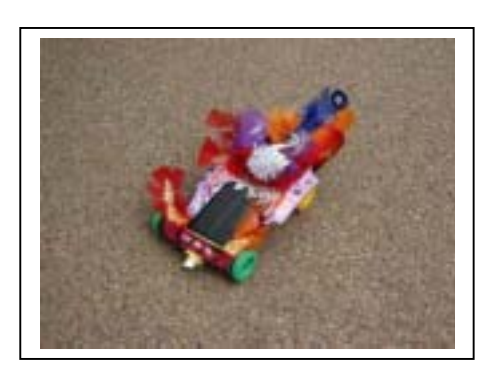
'The Majestic' - Churchill Primary