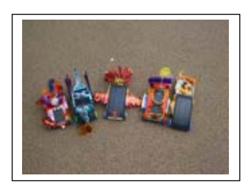
Competitors in the Creative Car Competition

WINNER – 'Fire Flame' by High Firs Primary School RUNNER-UP – 'Dragon Knight' by Edenbridge Primary School