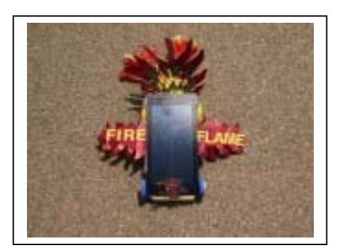
'Fire Flame' – High Firs Primary