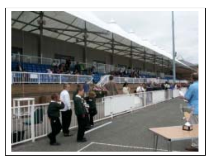
The excitement builds!