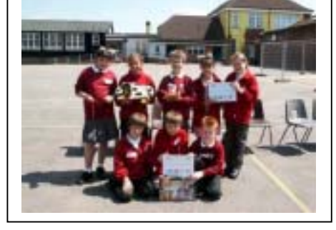
The team from Challock