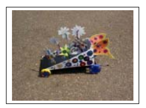
'Fairy Dust' – Speldhurst Primary