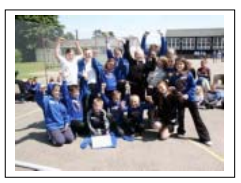
Ashford South celebrates!

WINNER – 'Scampi Racer' by Challock Primary School RUNNER-UP – 'Buddy Mobile' by Bethersden Primary School