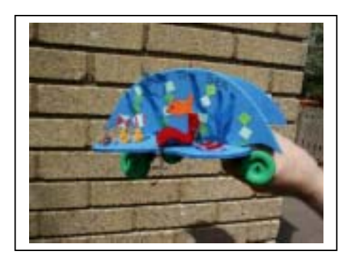
'Under the Sea' – Palmarsh Primary