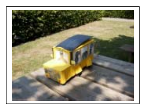
'Solar School Bus' - Graveney Primary