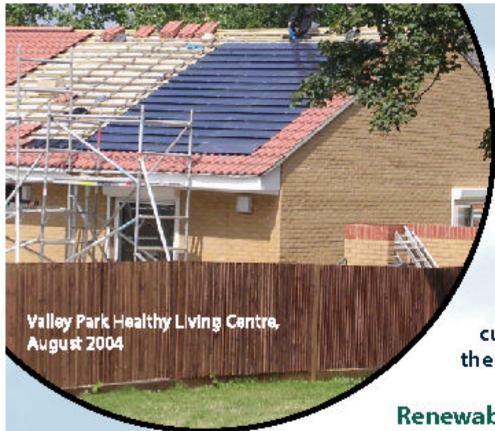
Valley Park Healthy Living Centre, August 2004

Working with schools in Westminster and Croydon, the project team plans to install a range of renewable energy technologies, including a small wind turbine.